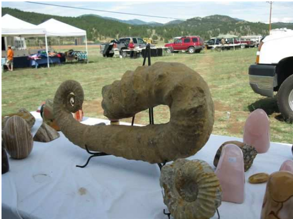
Spectacular Moroccan ammonites and other goodies