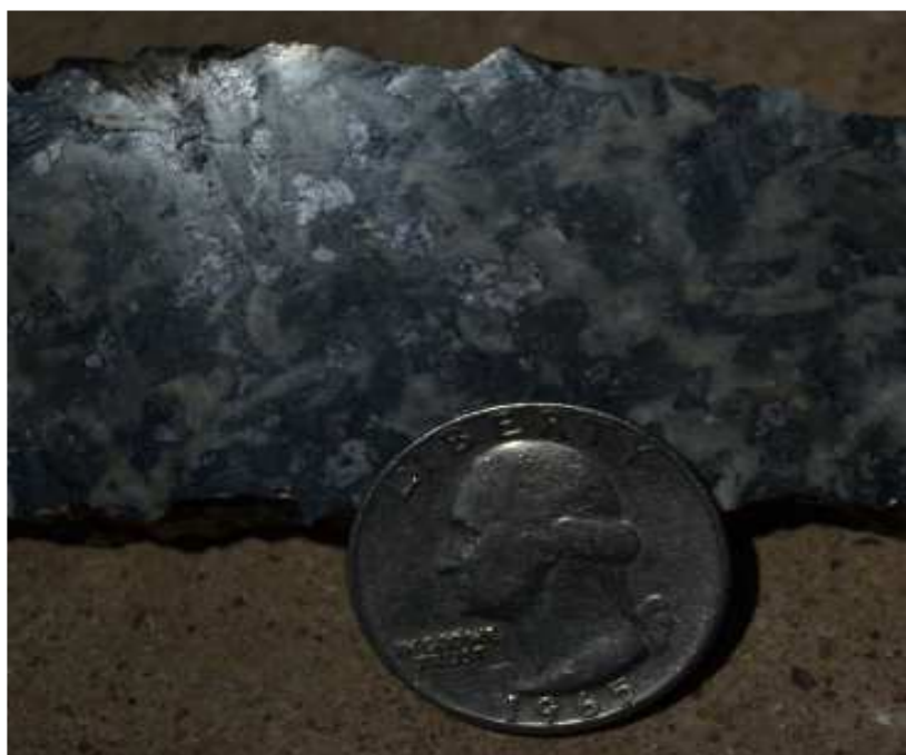
Figure 5: Gabbro from the outer ring of BQMI, showing abundant ilmenite grains in reflected light (top portion).

Examination under a binocular microscope, without the benefit of thin sections or more sophisticated mineralogical techniques, reveals many similarities between Texas Ilanite and Colorado quartz latite: silica rich calc-alkaline compositions for both; unusual blue quartz having the same crystal size (usually about 2 mm diameter); similar porphyritic-aphanitic to fine grained phaneritic-porphyritic textures more typical of volcanic rocks than igneous intrusives; reaction rims around some K-feldspar crystals; biotite mica