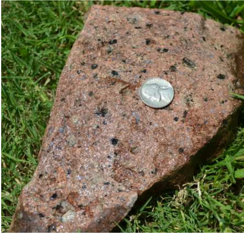
Figure 6: Quartz latite porphyry from Colorado's BQMI, the host of the blue quartz. This rock grades into a quartz monzonite porphyry, as described by USGS.

included within some K-feldspar grains; and the likelihood that titanium is the chromophore (coloring agent) in the quartz for both.