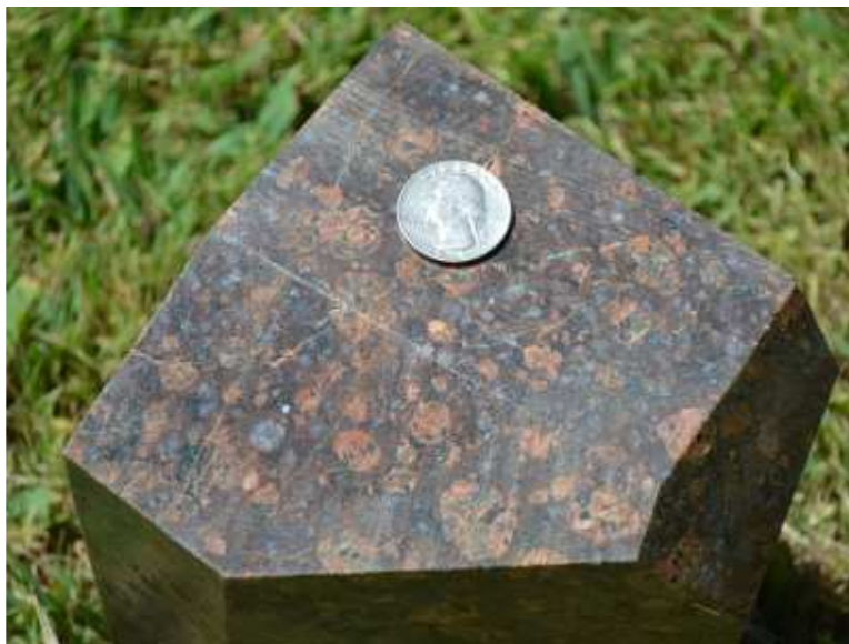
Fig 1: Typical Texas llanite (rhyolite), showing blue quartz crystals and pink K-feldspar phenocrysts in a dark groundmass (porphyritic-aphanitic texture).

Many mineral collectors are aware of a hard, attractive rock (fig. 1) from the Texas hill country west of Austin, informally known as “llanite” or “llanoite”. Occurring as dikes injected into the 1-billion-year-old Town Mountain Granite and older metamorphic rocks, the rhyolite contains unusual blue quartz as bipyramidal crystals.