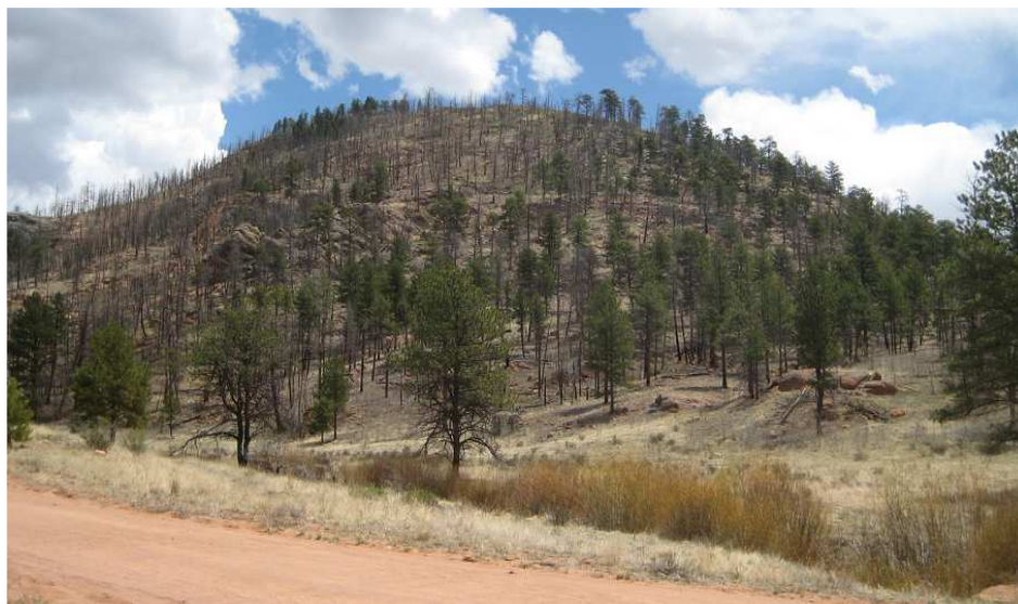
Figure 2: Blue quartz is found only on and near the topographic crest (elevation 8906 feet) of this unnamed mountain, extensively burned by the very large Hayman fire of 2002.

Library research by the author recently uncovered references (Hawley, 1969; Hawley and Wobus, 1977) to blue quartz within a small, unnamed, circular or funnel-shaped zoned intrusion in the Tarryall Valley, Park County, Colorado. This is along the western edge of the Precambrian Pikes Peak batholith. While cryptocrystalline blue to pale blue quartz (agate, chalcedony) of volcanic origin has been documented in four counties of Colorado (Eckel, 1997), the Tarryall Valley quartz is exceptional because it is of the relatively coarsely crystalline, subhedral to euhedral variety, hosted within a plutonic rock. This rock occurs only on and near the topographic crest of a small mountain having no formal USGS place name (figure 2). For purposes of this article, the locality is named “Blue Quartz Mountain”, and the unnamed igneous pluton “Blue Quartz Mountain Intrusive”, or “BQMI.