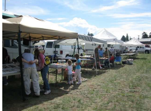
Potential Pebble Pups?