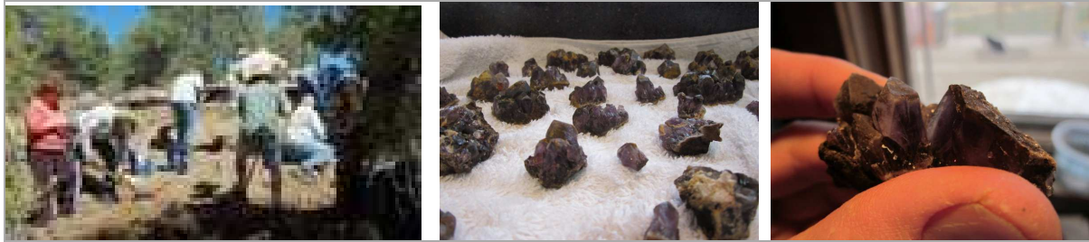
New Hope digging ; amethyst finds.

💧 Thirty-eight members of the Lake George and Pueblo clubs had a great time at the New Hope amethyst claim on May 7. Literally tons of amethyst were available for the picking.