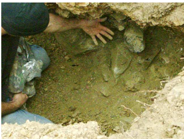
Piety Claim smoky quartz crystals.