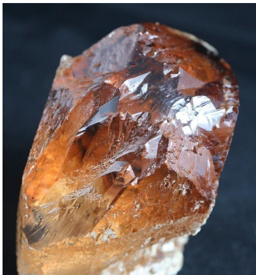
This one-pound topaz crystal was found near Cameron Cone in 2012.