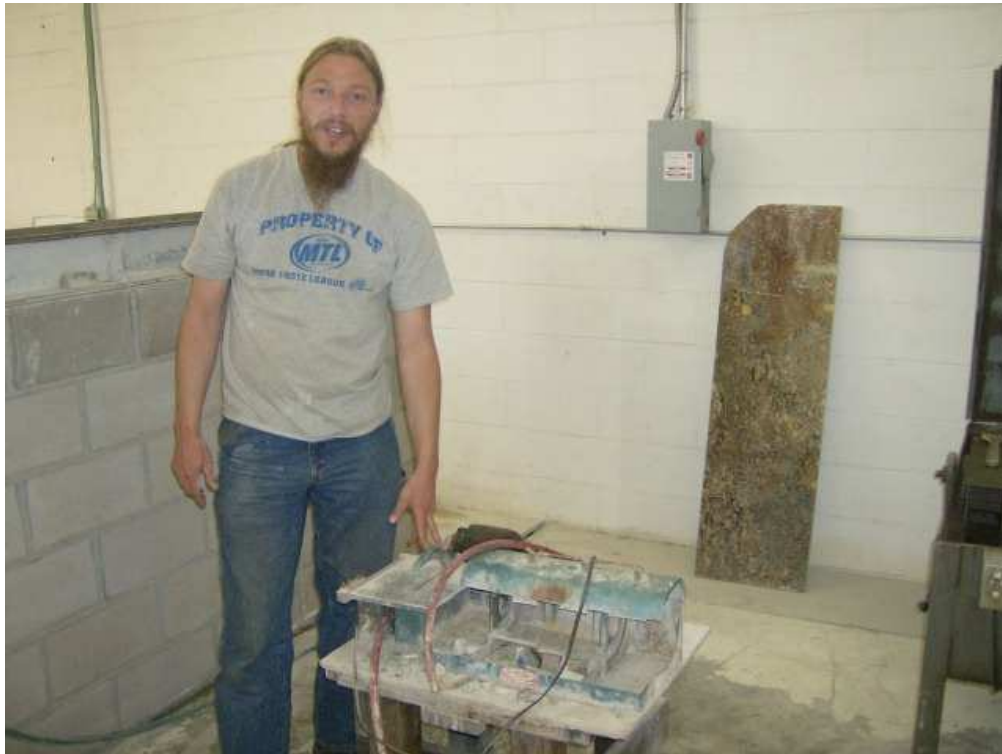
Thanks, Quentin!

⇒⇒ Dick Lackmond sent the following additional information about the new lapidary shop: