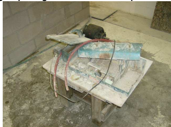
Unloading the cab machine (left) and (right) the machine will need some work!