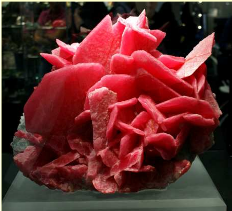
Empress of China Rhodochrosite specimen (google.com)