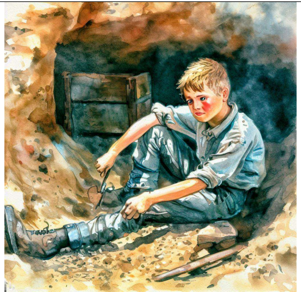
A Pick Boy takes a break deep underground. This AI image was created by the author with the assistance of DALL·E and MS Bing.

↘ Wayne Orlowski sent a mind-blowing video giving a history of oil production by country: https://youtu.be/syoN4Siomrw