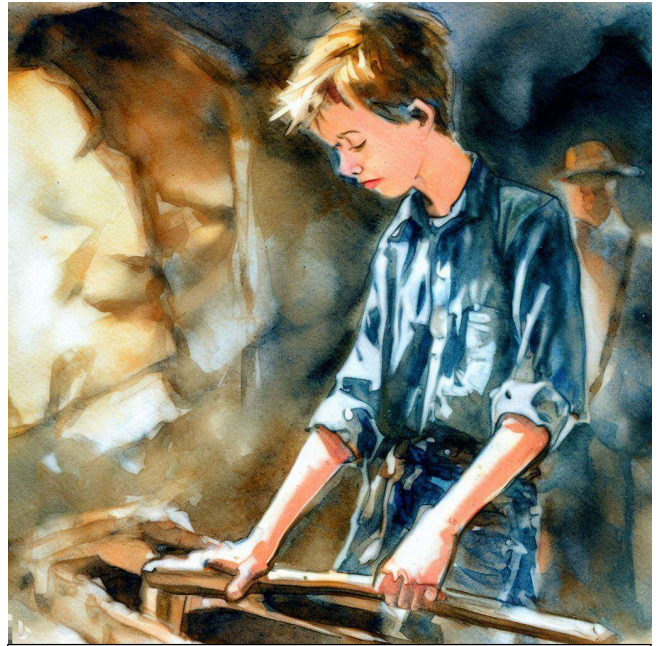
A Pick Boy at work. This AI image was created by the author with the assistance of DALL·E and MS Bing.

The roar of blasting and the racket of drills was constant. Yet they worked in deliberate routines to earn their meager pay in a time and place so different from today.