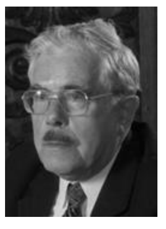
Fig. 1 Alfred Treibs, PhD (1899 – 1983) The prestigious Treibs Award is named after him.

In 1936, Alfred Treibs, a German organic chemist, announced that vanadyl porphyrin found in rocks is a chemical fossil of chlorophyll, which plants, algae and bacteria need for photosynthesis.