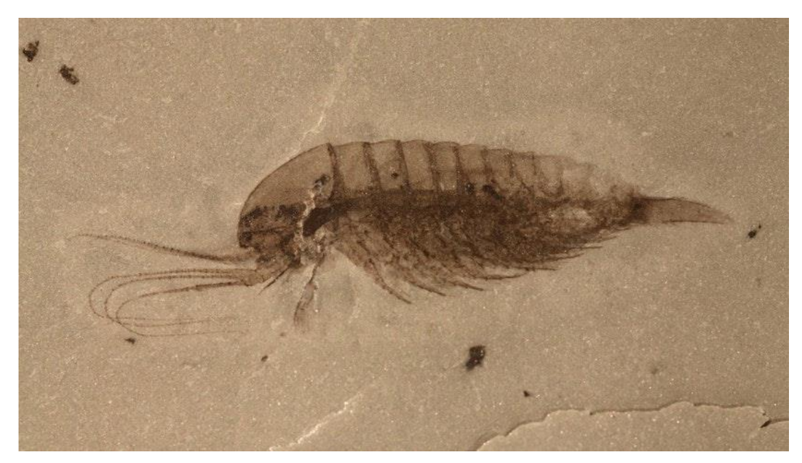
Fig. 3. Early Cambrian predatory heavyweight: A fossil of the shrimp-like arthropod Leanchoilia . Life had already come a long way by 518 million years ago.

including the chordates, which eventually gave rise to fish, dinosaurs, birds, cab drivers and astronauts. It was an event that scientists call The Cambrian Explosion.